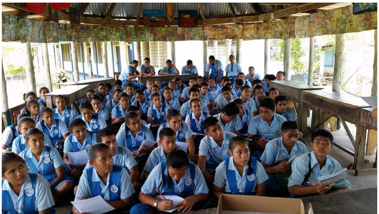
SCHOOL SURVEY AT ITU O ASAU COLLEGE, 12 MARCH 2015