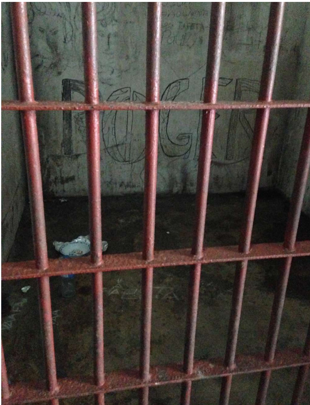
CUSTODY CELLS AT TUASIVI CUSTODY CELLS, SAVAII, JANUARY 2015