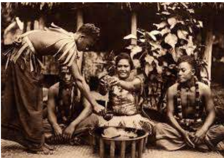
SAMOAN CULTURE AND TRADITIONS: 'THE AVA CEREMONY'