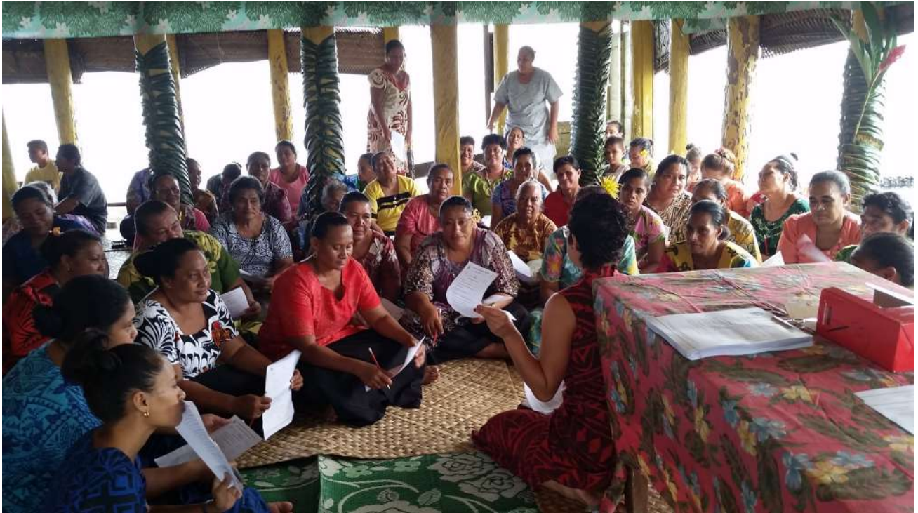
WOMEN FOCUS GROUP DISCUSSIONS IN THE VILLAGE OF SASINA, SAVAII, 12 MARCH 2015.