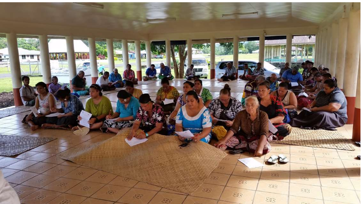
IVA VILLAGE CONSULTATIONS, 11 MARCH 2015