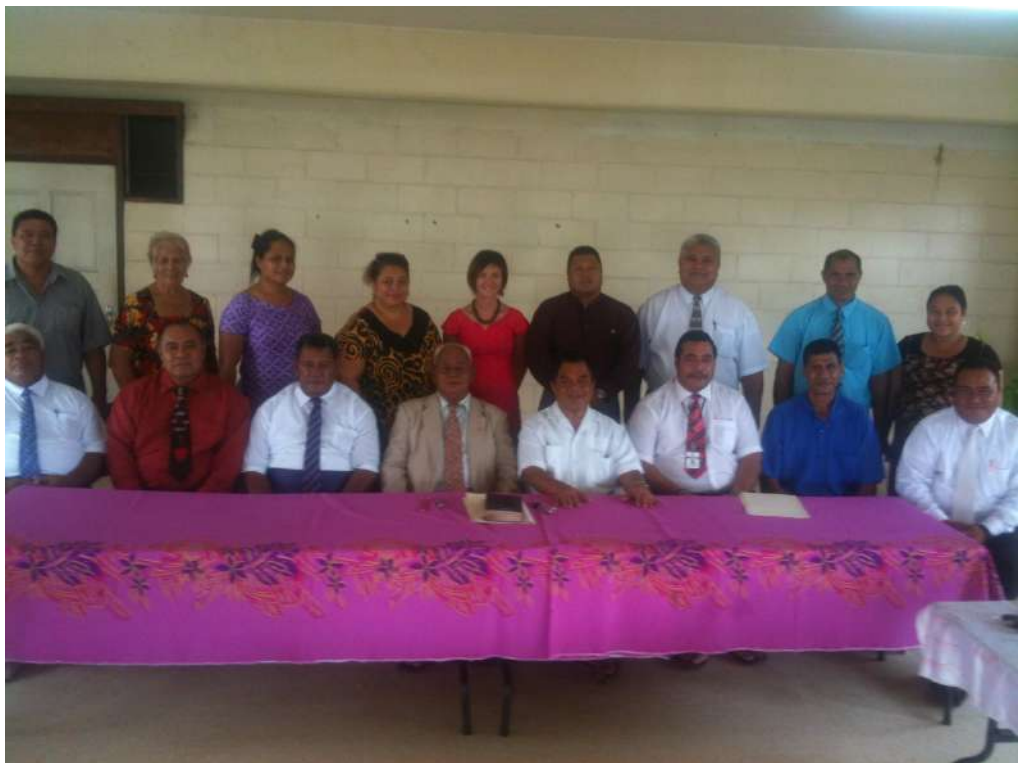
NHRI IN CONSULTATION WITH THE NATIONAL COUNCIL OF CHURCHES 12 MARCH 2015