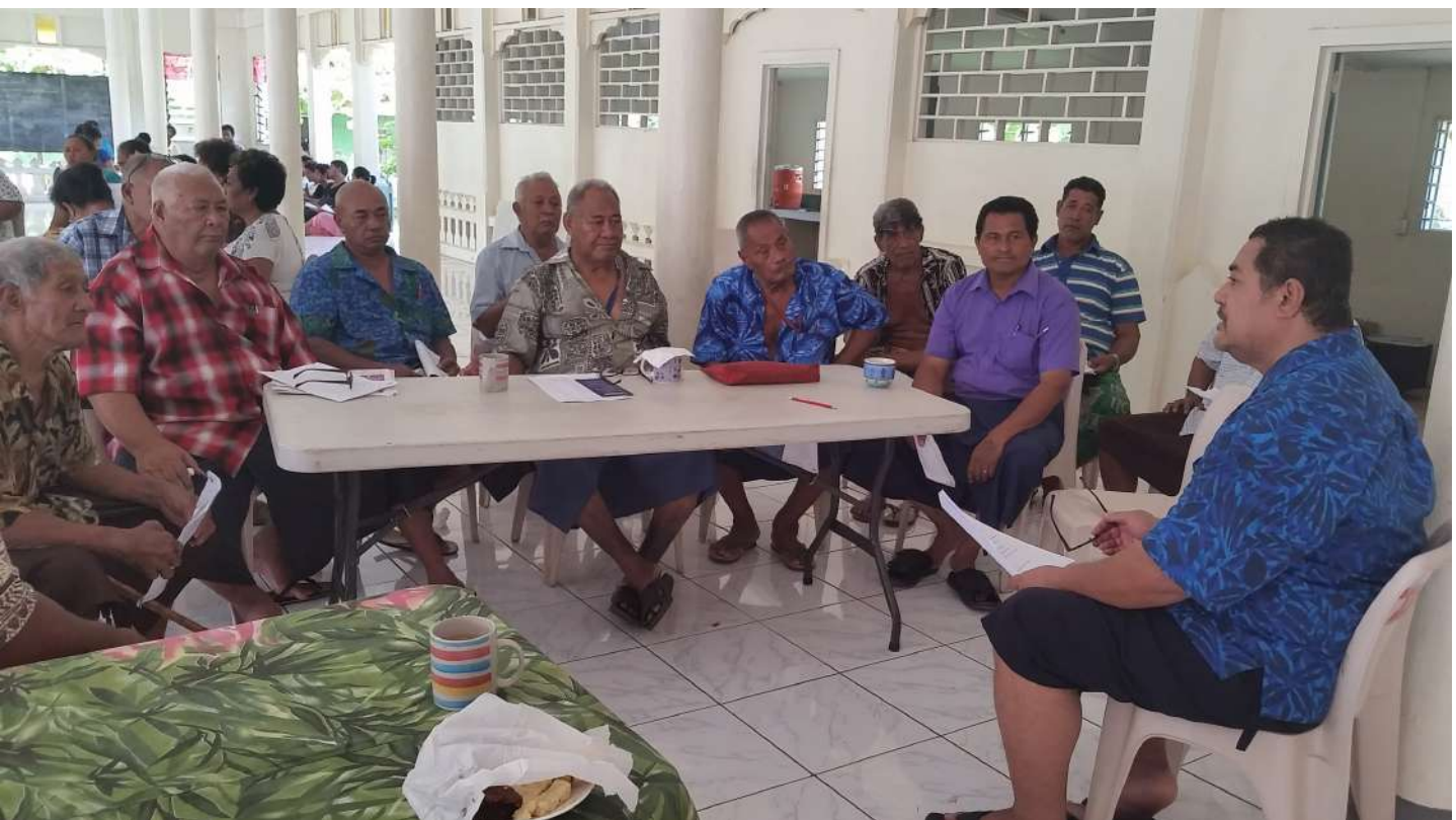
TITLED AND UNTITLED MEN FOCUS GROUP DISCUSSIONS IN THE VILLAGE OF MOATA'A, 14 MARCH 2015.