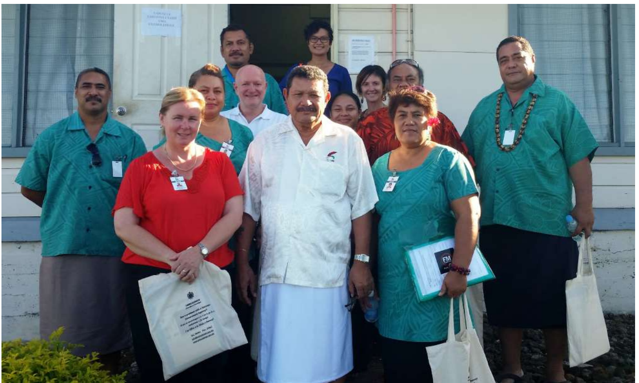
NHRI INSPECTIONS TEAM WITH PRISONS AND CORRECTIONS COMMISSIONER, TAITOSUA F E WINTERSTEIN, JANUARY 2015