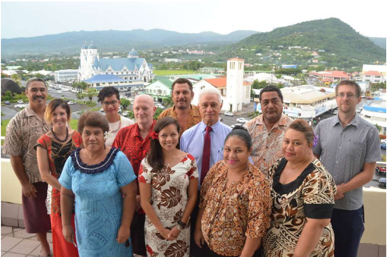
STAFF OF THE OFFICE OF THE OMBUDSMAN AND NHRI 2015