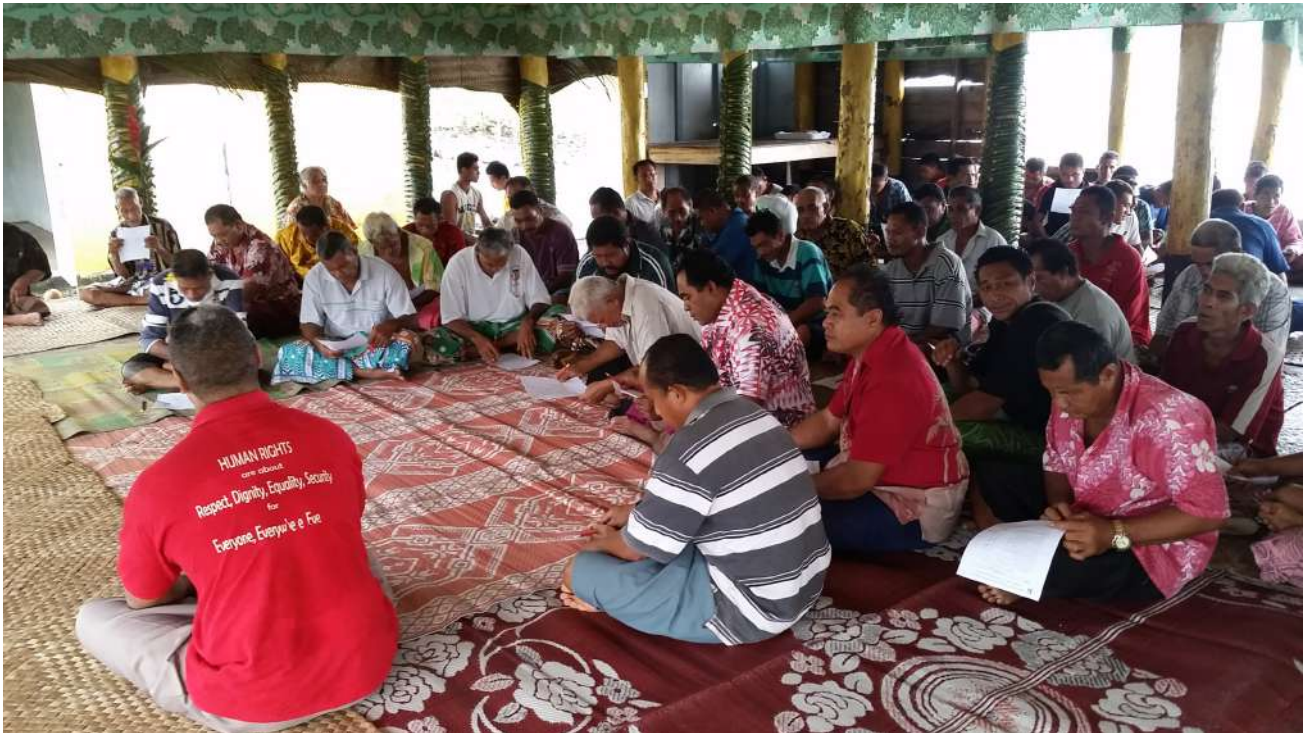
TITLED AND UNTITLED MEN FOCUS GROUP DISCUSSIONS IN THE VILLAGE OF SASINA, SAVAII, 12 MARCH 2014