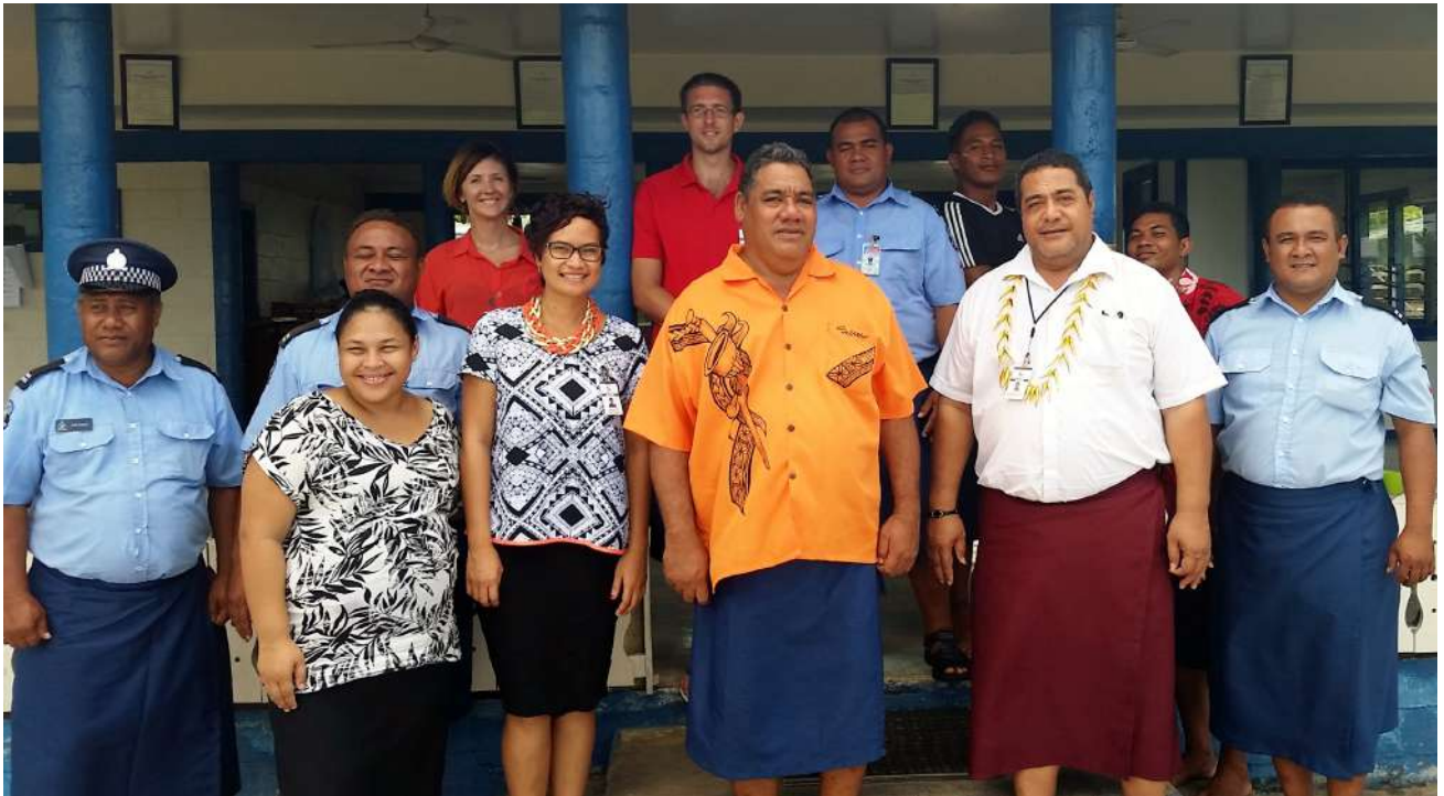
NHRI INSPECTION TEAM WITH PRISONS AND CORRECTIONS OFFICERS AT OLOMANU JUVENILE CENTRE, JANUARY 2015