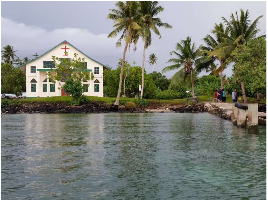
METHODIST CHURCH ON MANONO ISLAND