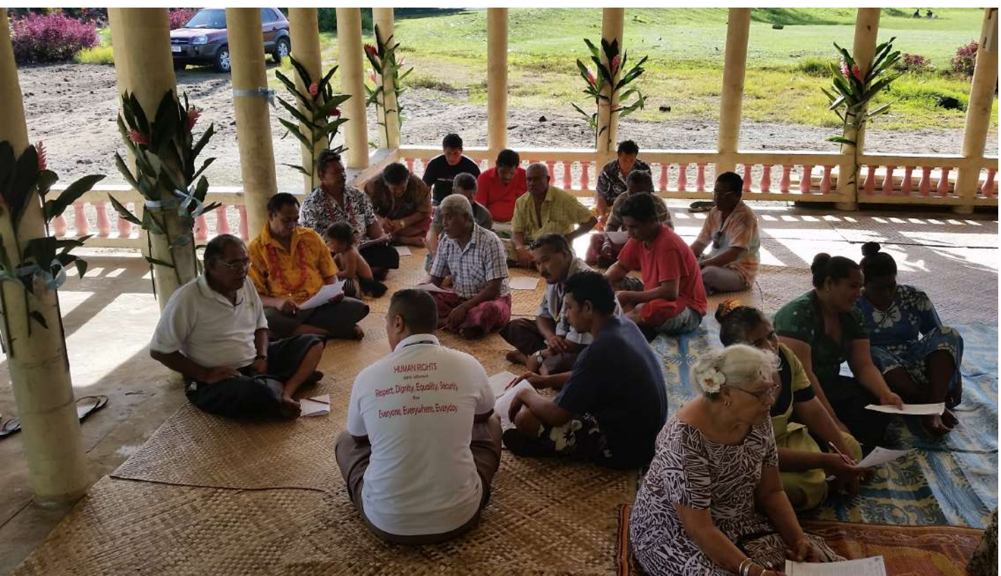
MEN FOCUS GROUP DISCUSSIONS AT THE VILLAGE OF FALEALUPO, SAVAIL, 13 MARCH 2015