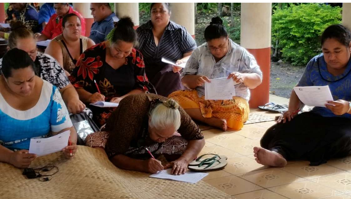
WOMEN FOCUS GROUP DISCUSSIONS IN THE VILLAGE OF IVA, SAVAII, 11 MARCH 2015