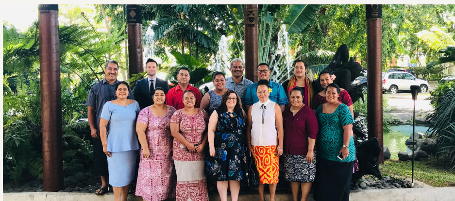
Participants including 5 Office staff who took part in the Advanced Administrative Investigations training facilitated by Commonwealth Ombudsman held in Apia from 24-26 June 2019.

The Office took part in the evaluation of the review of the Public Administration Sector Plan 2013/2014 – 2017/2018 and the development of the new PASP 2019/19 – 2022/23 which has yet to be finalized for adoption by the Public Administration Sector Steering Committee later this year.