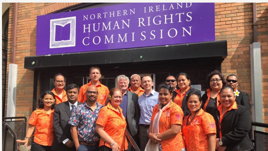
Participants from the different formed and potential NHRI across the Pacific including three representatives from NHRI Samoa who took part in the 5 day Human Rights Pacific Exchange that took place in Northern Ireland and the UK in June 2019.