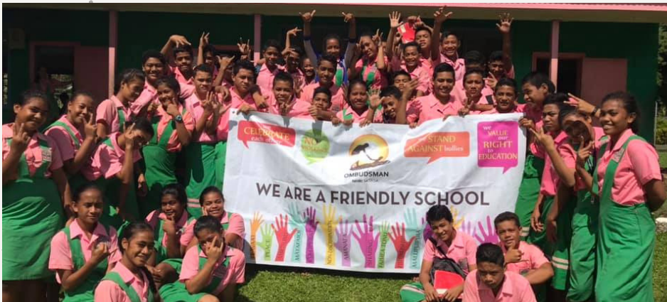
Students of Vaimauga College during the Office's Friendly School Program held in May 2019.