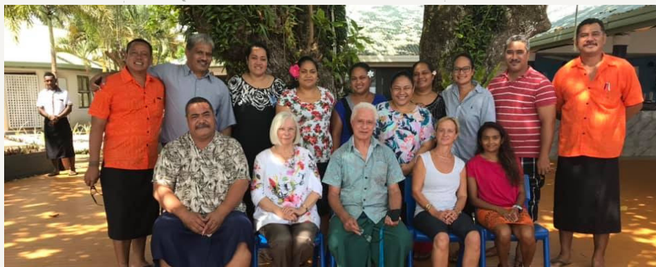
Office staff with consultants from APF and Samoa at the 3 day review of the Office's Strategic Plan 2016-2020 and Capacity Assessment held at Le Uaina Beach Resort in May 2019.